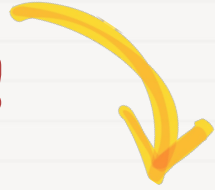
Table of Contents!